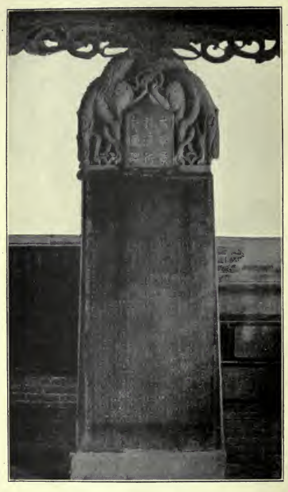
THE "NESTORIAN MONUMENT" IN THE PEI\ LIN AT HSI-AN FU.