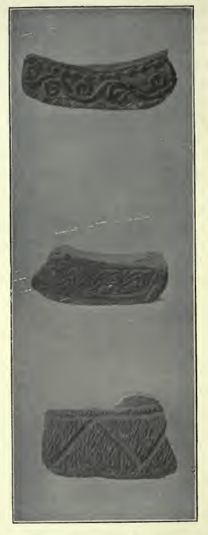
PIECES OF INCENSE-WOOD.