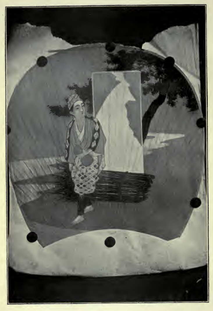
JAPANESE FAN, SHOWING A PHRYGIAN CAP. [To face p. 39.