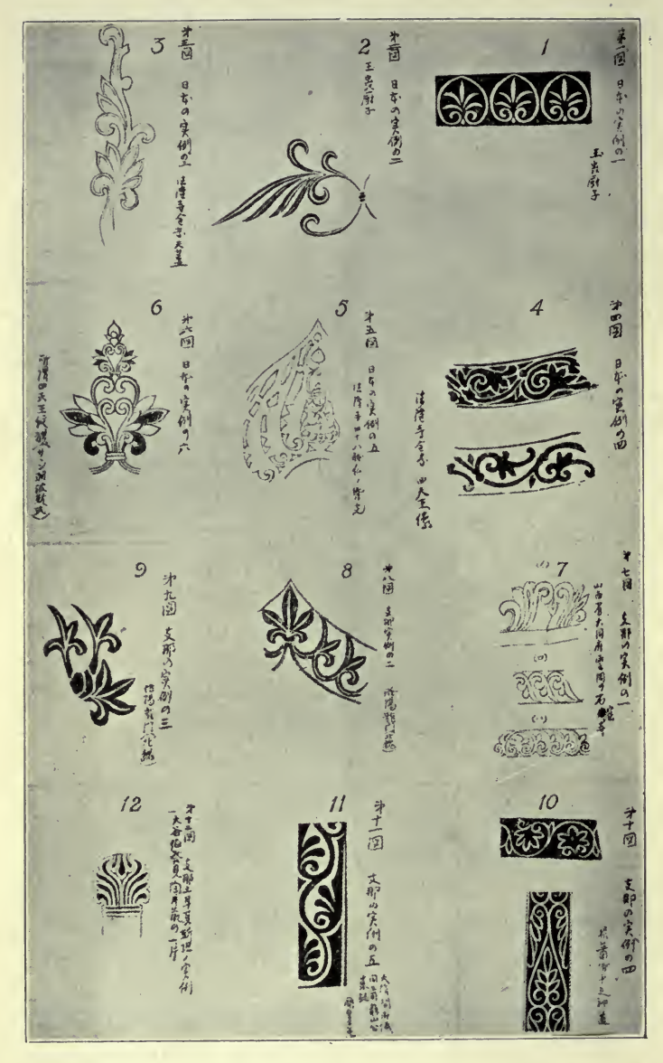
SPECIMENS OF THE "HONEYSUCKLE" PATTERN FROM JAPANESE (1-6) AND CHINESE (7-12) BUILDINGS.