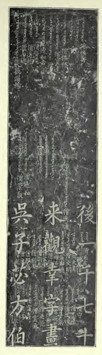
THE NAMES ON THE LEFT SIDE OF THE MONUMENT. (Translated, pp. 176-178.) [To face p. 176.