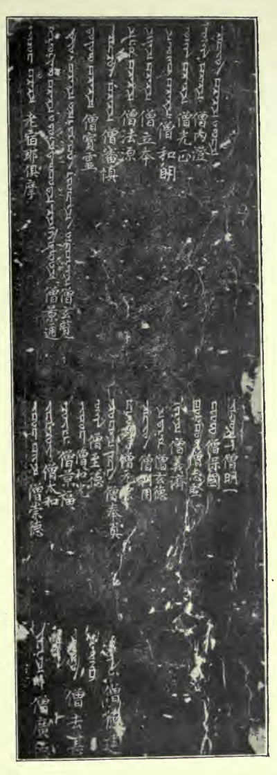
THE NAMES ON THE RIGHT SIDE OF THE MONUMENT. (Translated, pp. 178-180.) [To face p. 180.]