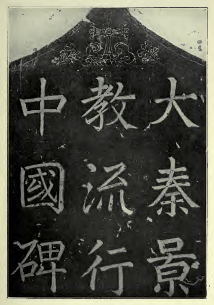
THE CROSS AND TITLE OF THE "NESTORIAN MONUMENT." (The title is translated in italics on p. 162, opposite.) [To face p. 162.